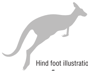
Hind foot illustration